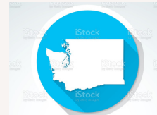
UNIVERSITY OF WASHINGTON