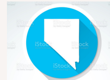
UNIVERSITY OF NEVADA, LAS VEGAS