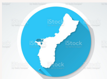
UNIVERSITY OF GUAM