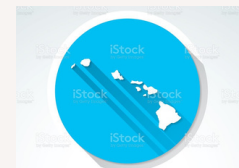
HAWAII COMMUNITY COLLEGE KAUAI COMMUNITY COLLEGE

To increase Native Hawaiian and Pacific Islander student success, APIA Scholars is partnering with AANAPISIs and UCLA's Institute for Immigration, Globalization and Education in collaborative research* with (8) colleges to impact data disaggregation, equitable supports, and school climate.