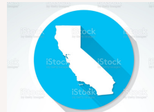
MT. SAN ANTONIO COLLEGE COLLEGE OF SAN MATEO